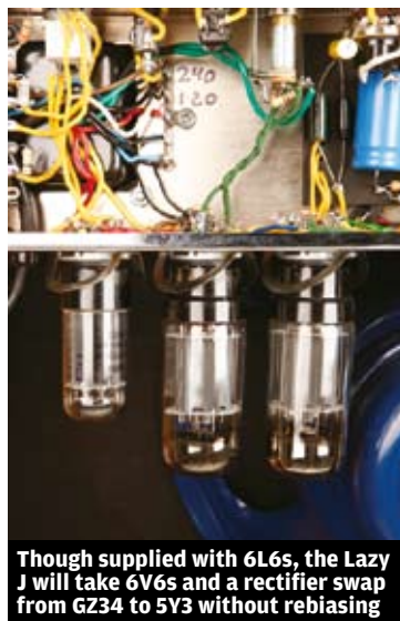
Though supplied with 6L6s, the Lazy J will take 6V6s and a rectifier swap from GZ34 to 5Y3 without rebiasing

Tweed Deluxe volume controls had to go up to 12, because the first two increments don't work. The Lazy J is just the same: it abruptly wakes up somewhere between 2 and 3. By 4 overdrive is quite apparent, although you do get a touch more clean headroom through Input 2. There's no shortage of chimey treble for country twang or stinging, wiry blues sounds, and you can roll back the Tone control for a woodier, smoothed-over sound. What else can it do? Well, what can't it